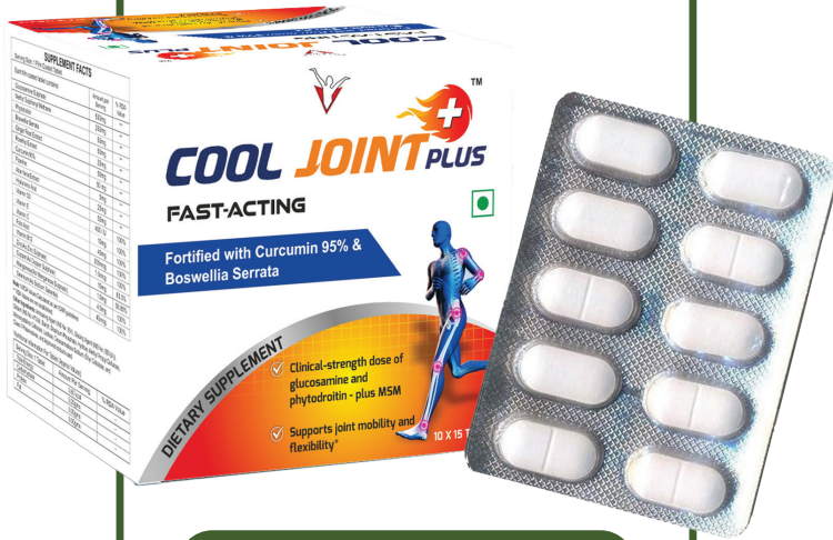
Cool Joint Joint Care Tablets