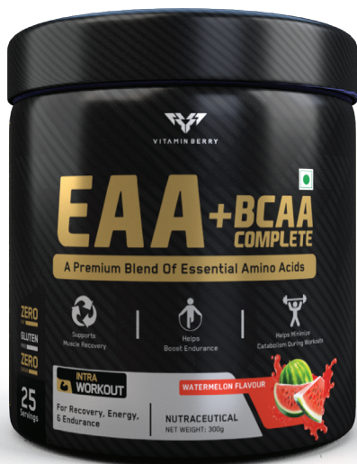
EAA+BCAA Amino Acid Blend