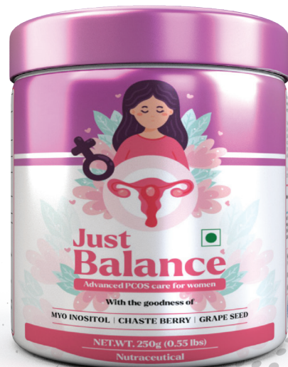
Just Balance Advanced PCOS Care