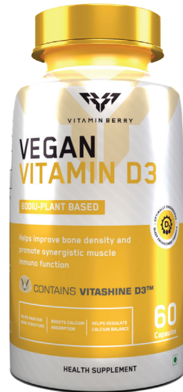
Vitamin D3 Made Using Vitashine D3™