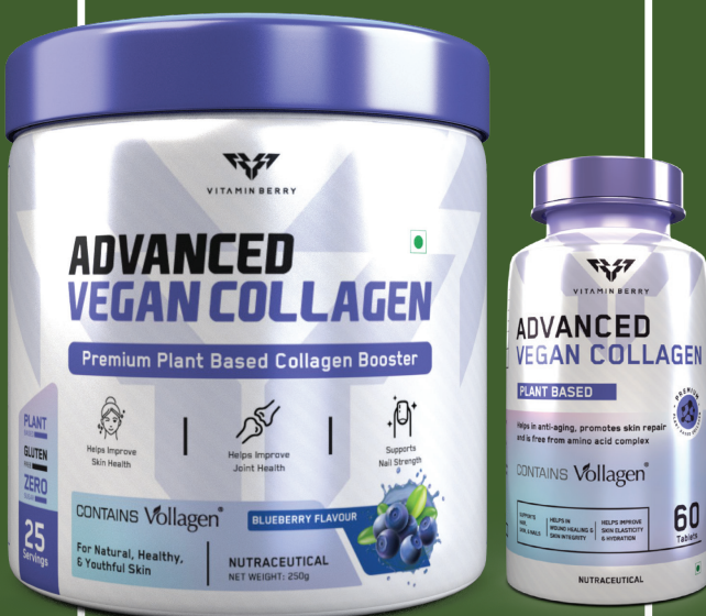
Vegan Collagen Made Using Vollagen®