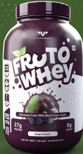
Fruto Whey Fruit Flavoured Whey Isolate