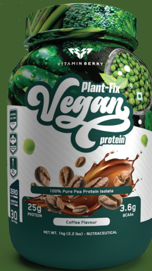
Vegan Protein Premium Plant Protein